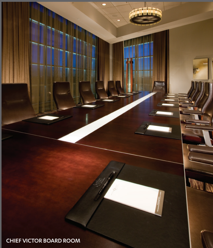
KALISPEL CONFERENCE CENTER