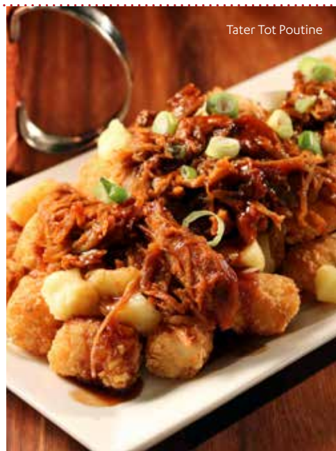
Tater Tot Poutine

Soy, ginger and cilantro infused waygu beef, toasted brioche bun, sweet chili aioli, horsey jalapeño slaw One 5 / Two 9 / Three 13